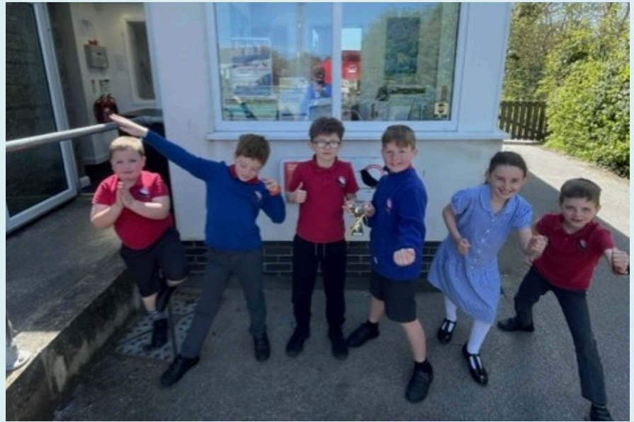
Well done to Longships for winning the house football competition.